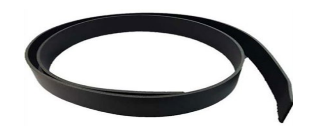
XL Length, 3.5mm Thick