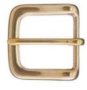
West End Buckle