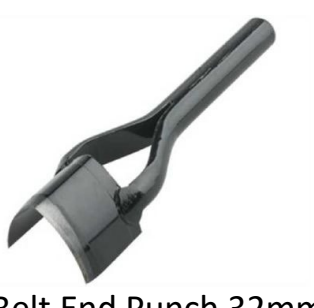
1 x Belt End Punch 32mm