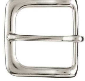
1 x 38mm Stainless