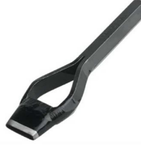
1 x Oblong Punch 20mm