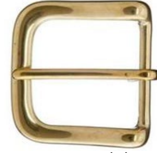
1 x 32mm Solid Brass 1 x 38mm Solid Brass West End Buckle